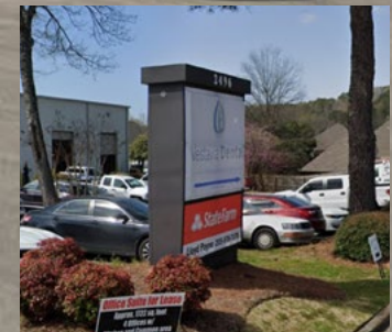
HIGHLY VISIBLE MONUMENT SIGN