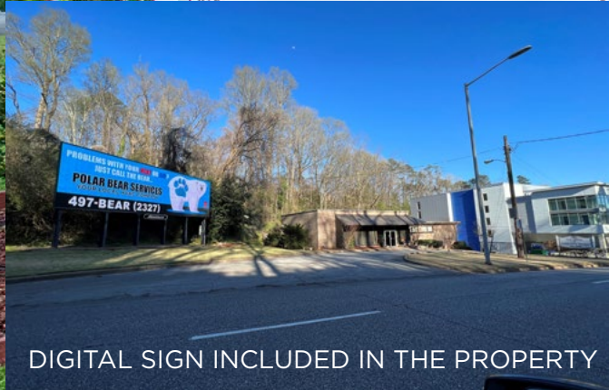
DIGITAL SIGN INCLUDED IN THE PROPERTY