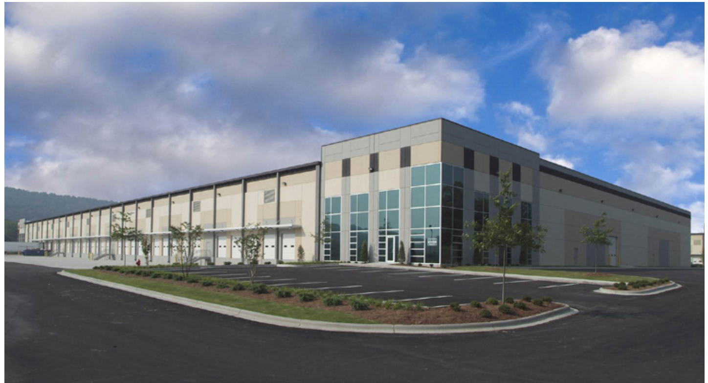
▲ Building #2

Sonny Culp, SIOR 205.871.7100 sonnyc@grahamcompany.com